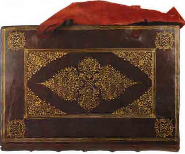
A 1632 Book of Common Prayer used at the English Embassy in Paris during the Interregnum. Purchased with the aid of the Friends in 1977 and conserved at Lambeth.