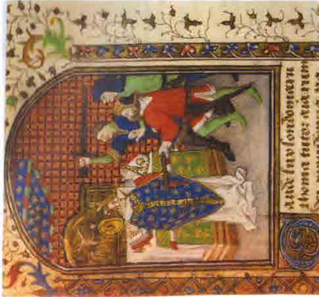
The martyrdom of St. Thomas Becket, from the Tarterlon Hours c.1430. Purchased with the aid of the Friends 2003.